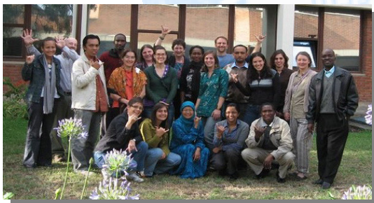
Participants from the First KS Workshop at Face-to-Face Meeting in Ethiopia